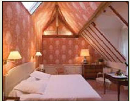
Rooms In the Residence