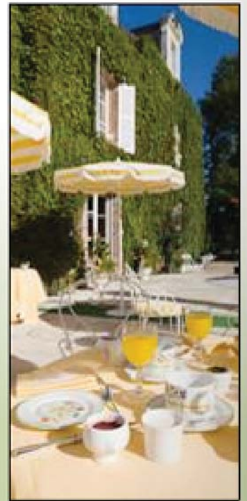
Hotel & Park