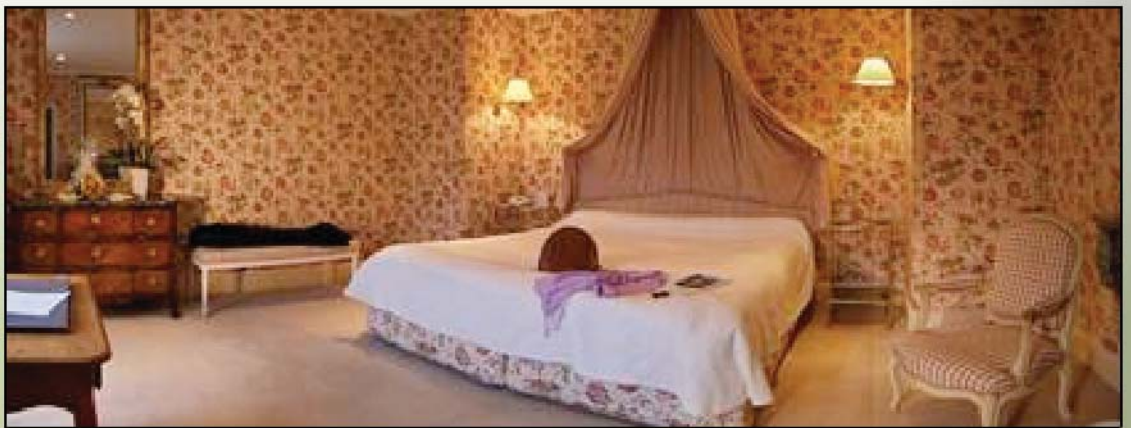
Rooms in the Castle